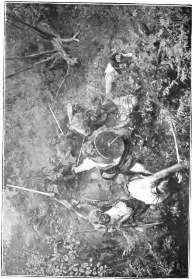
BATTLE OF BANNOCKBURN Frontispiece, Scotland, vol two